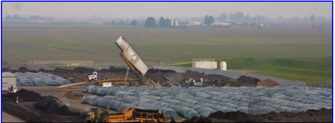
San Francisco exceeds a 50% diversion of organics from the wastestream

Proven technology is used for filling the elongated flexible plastic bag called an EcoPOD® (Preferred Organic Digester) with positive aeration and control. The equipment is derived from 20 years of successful agricultural feed storage usage. The controlled compaction is used for all types of materials, densities, moistures, and particle sizes. Each EcoPOD® is adjusted with its own valving and aeration controls to individualize the composting process, yet use a minimal amount of labor and supervision. Our system is reliable and efficient with capacities to match any requirement. Ag-Bag Environmental offers a patented technology with a high degree of process control.